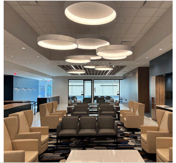
Pictured Above: TRS Member Center, located in Austin's Mueller Community, coming soon.

It's almost ready – your TRS Member Center! Later this May, we expect to welcome the first visitors for counseling appointments at your TRS Member Center at the new TRS headquarters in Austin's Mueller Community. The Member Center will further enhance customer service for members and the efficiency of pension fund operations. You'll find the facility optimized for both efficiency and comfort as you receive the same important services we provide today.