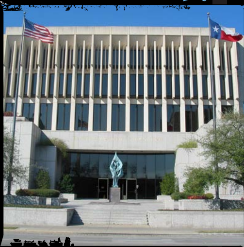
The Eighth Headquarters (1987) 1000 Red River Street