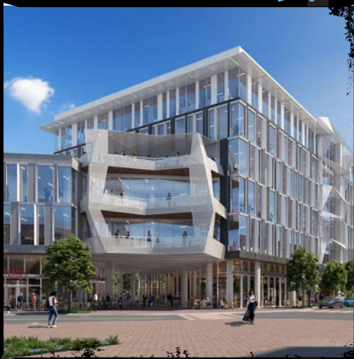
The Ninth Headquarters (2023) Mueller Business District