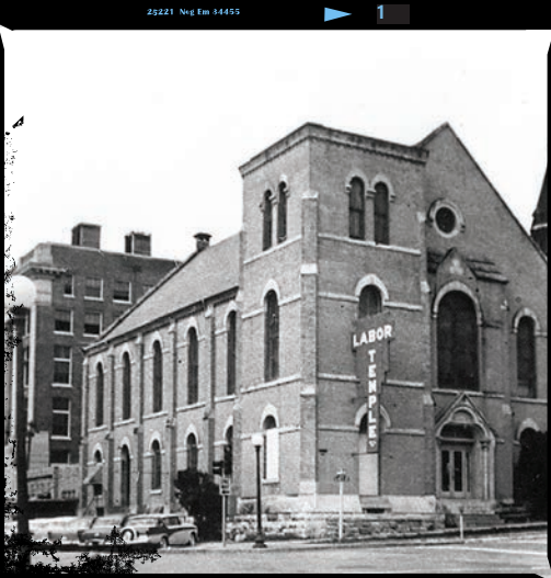
The First Headquarters (1938) Austin Labor Temple 200 East 10th Street