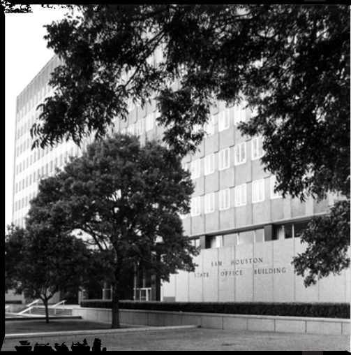
The Fifth Headquarters (1959) Sam Houston State Office Building 14th Street and San Jacinto Boulevard