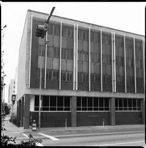
The Fourth Headquarters (1954) First Federal Savings & Loan Building 11th and San Jacinto Streets