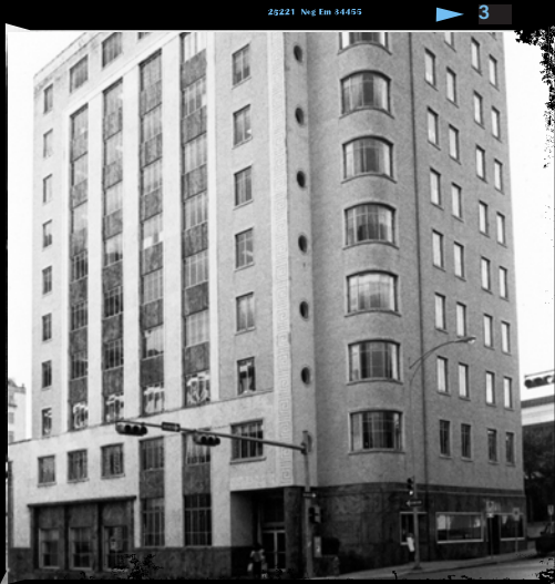
The Third Headquarters (1946) The Tribune Building 10th and Colorado Streets