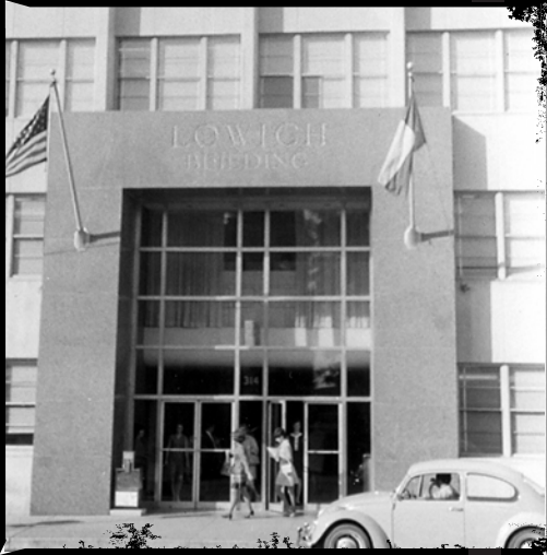
The Sixth Headquarters (1964) Lowich Building 11th and Guadalupe Streets