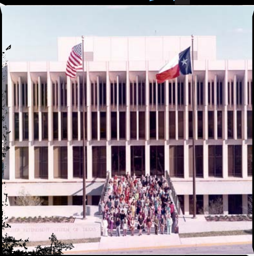
The Seventh Headquarters (1973) 1001 Trinity Street